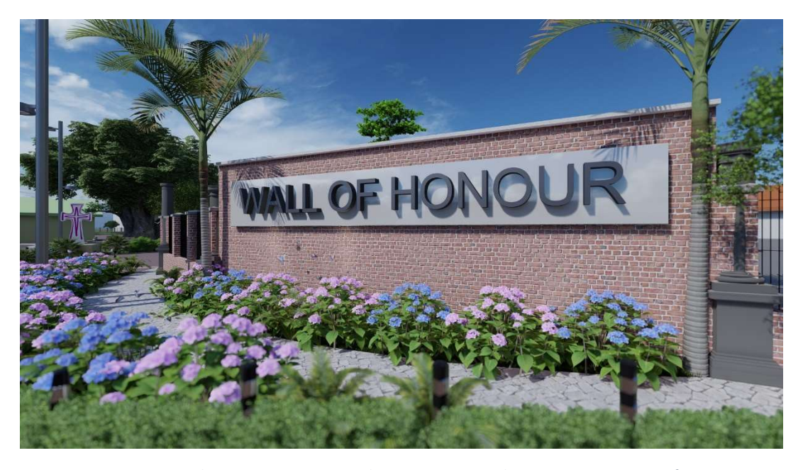
Figure 3 We must honour our Sponsors and Donors to inspire the coming generations of Mercy.