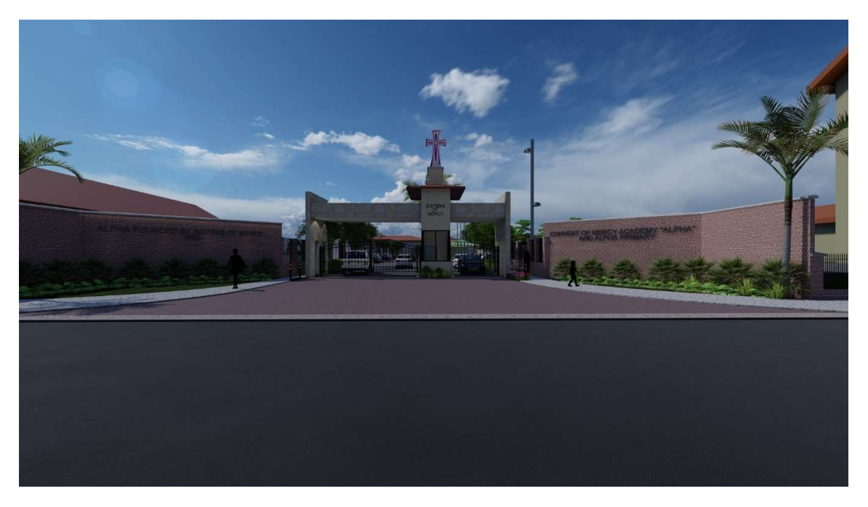
Figure 2 Day and Night Presence.